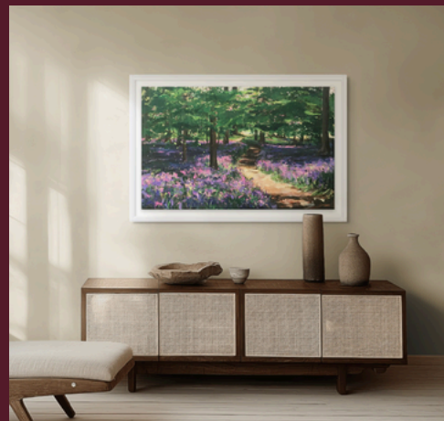
Together Again, Framed Size: 91 x 131 cm, £3,500