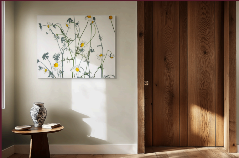
Roman Chamomile III, Canvas Size: 100 x 80cm, £1,700

"Having grown up in the countryside with two avid gardeners for parents, it was a natural pathway for my art to take. The intention - is to depict the natural world, representing it through the medium of paint both accurately and realistically."