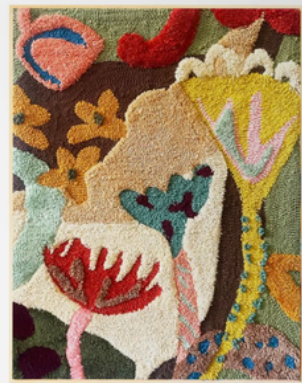
Hemsted, Framed Size: 63.5 x 84.5 cm, £1,600