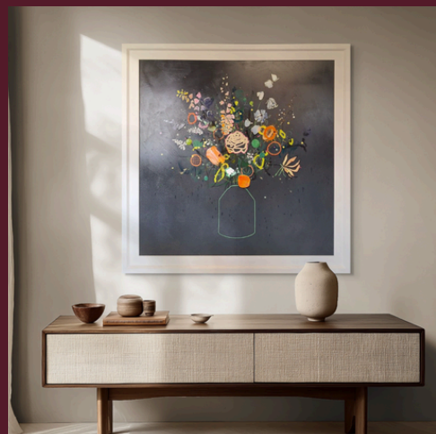
Orange Pop, Framed Size: 115 x 115 cm, £3,695