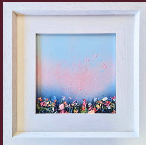
Strawberry Glow, Framed Size: 37 x 37 cm, £495

"I really enjoy expressive mark making especially with the spray paint and big blobs of textured paint. I love trying new techniques, stencils, materials to create something new and fresh. Allowing the composition to be free flowing and intuitive."