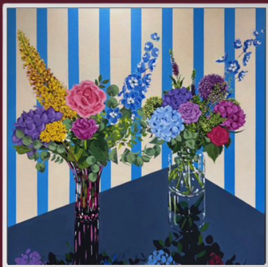
No Judgement Here, Framed Size: 107 x 107 cm, £2,495

Michelle Taube is a contemporary artist known for her expressive floral paintings that explore colour, pattern, and observation. Working primarily in oils, her compositions capture fleeting moments through playful brushwork and a fresh, contemporary approach to form. Her practice has evolved from a background in animation, illustration and teaching into a focused exploration of floral still life.