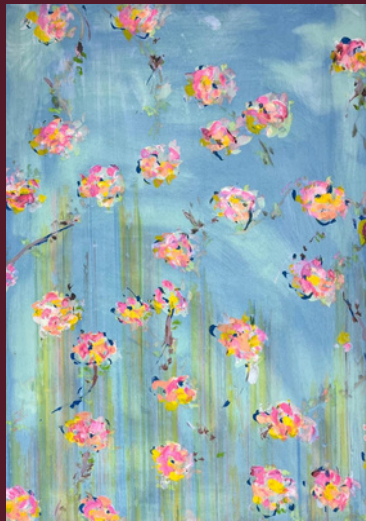
Soft Denim Carnival, Framed Size: 65 x 84 cm, £395