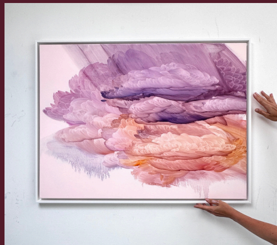
La Femme Nuage | Felicity, Framed Size: 55 x 75 cm, £900

"I work with heavily diluted oil paint, throwing it onto the canvas and allowing gravity to create its own beautiful textures. From there, I sculpt the petals by pushing the paint across the surface, often painting over earlier layers of my own work."