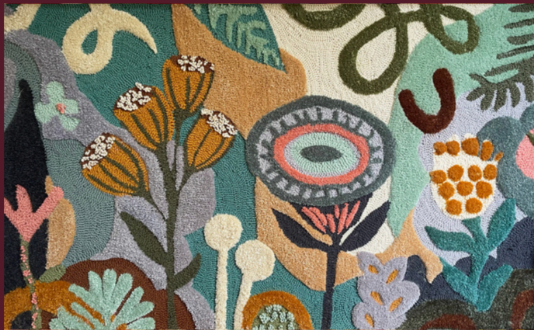
Ebernoe, Framed Size: 138 x 85 cm, £3,300

"I have always loved drawing and painting flowers and when I started working in wool I knew that I wanted to create textiles with botanical elements. The wool's inherent warmth and tactility lends itself to the fluid forms found in the natural world."