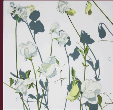
Lathyrus Odoratus II, Canvas Size: 40 x 40cm, £750