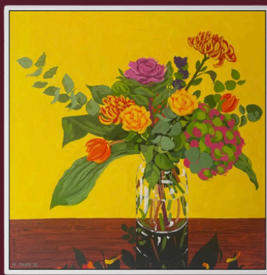
Birdsong, Framed Size: 54 x 54 cm, £950