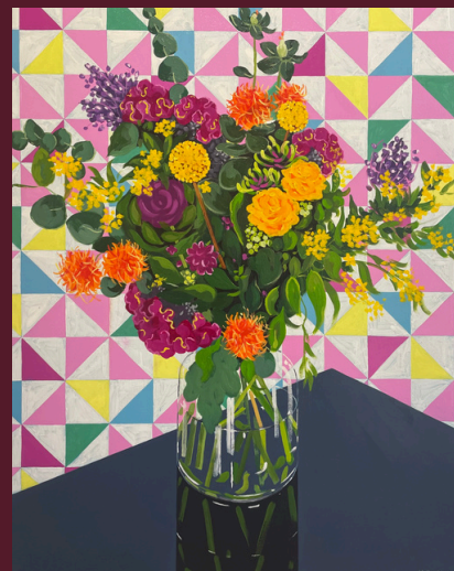
Avalanche, Framed Size: 84 x 104 cm, £1,895

"I think floral artwork remains timeless because artists are constantly challenging the idea of what florals are. I'd describe my work as joyous, humorous and uplifting."