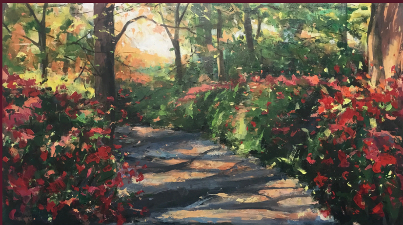
I Will Hold Your Hand, Framed Size: 71 x 111 cm, £1,900

"Flowers for me bring back memories, they connect us to people we love or have loved. My work is as much about connection as it is about florals and woods. I want my work to remind people of walks they've been on and whose hand they held along the way. My work is about connection, memory and love."