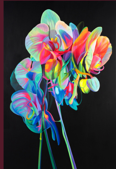
Where the Light Is, Framed Size: 107 x 156cm, £3,800