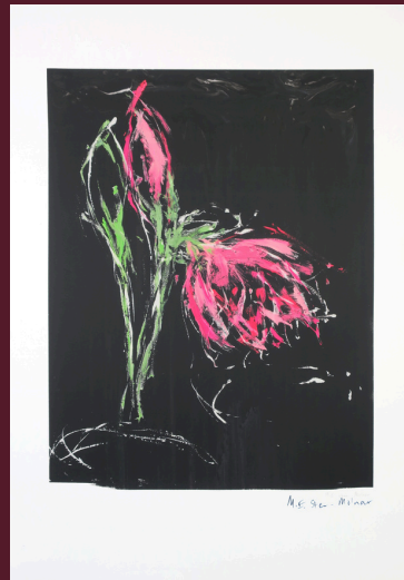
Amaryllis at Midnight, Image Size: 78 x 110 cm, £695