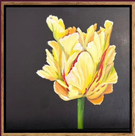
Grace, Framed Size: 30 x 30 cm, £300

"I think florals endure because they're never just about flowers, they're a kind of language artists keep coming back to. Florals sit in that space between the universal and the personal."