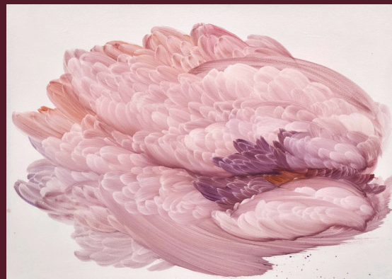
La Femme Nuage | Violet, Framed Size: 80 x 105 cm, £2,500