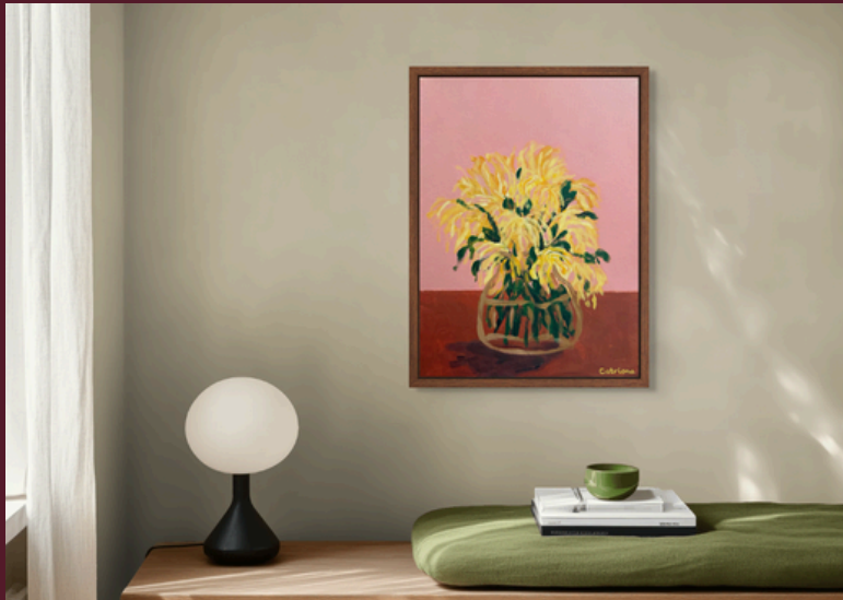
The Blondies, Framed Size: 35 x 45 cm, £595

Catriona Wood is a London-based artist known for her expressive floral and seascape paintings. Influenced by Impressionism, her work is loose, textured, and full of movement, created through layered acrylic and intuitive mark-making.