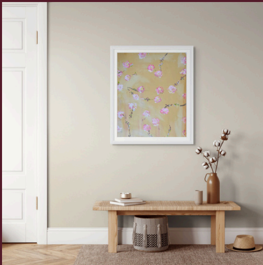
Sunset Faded Orange, Image Size: 56 x 77 cm, £495

"I'm constantly taking photos of flowers and work with them daily as a florist. My florals celebrate the beautiful imperfections of life."