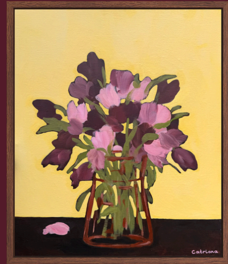
Tesco Finest, Framed Size: 45 x 55 cm, £895

"My work has moved away from exact replication towards a more expressive, imaginative approach - giving me the freedom to experiment with colour, form and composition."