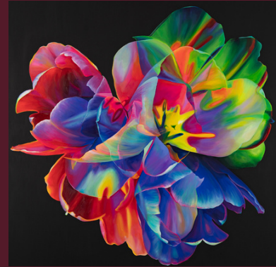
The Light Fantastic, Image Size: 100 x 100 cm, £5,000

"I'm most drawn to their transience... there's something profound in that decay, a kind of honesty. Through my floral paintings, I aim to create a space where viewers can pause, reflect, and connect with that fleeting sense of presence."