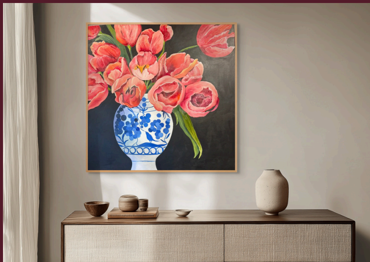
Solace, Framed Size: 90 x 90cm, £2,250